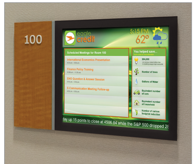
Dynamic digital solution highlighting the green aspects of the building

ASI understands the LEED ID points and can work with you to develop the messages for your educational signage program.