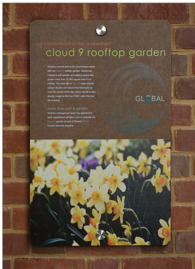
InTac™ Eco educational sign